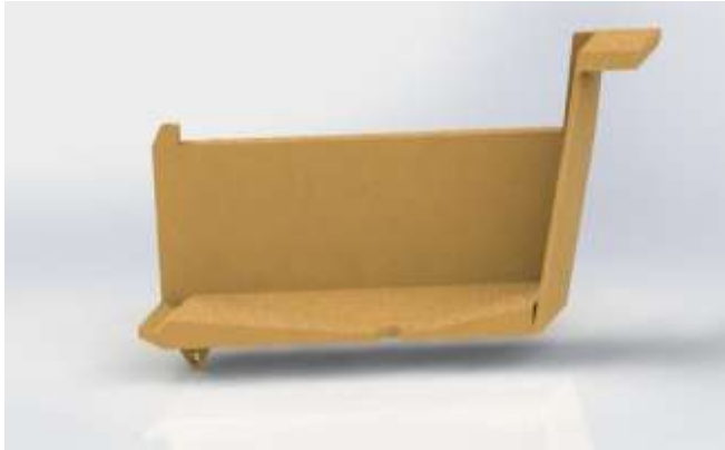
Fig -7: Cross-section of the modified truck

high difference with mean level of the road can be detected and filled automatically. The quantity of the patch material can also be governed with the help of sensors.