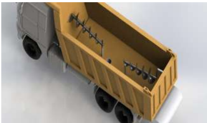
Fig -8: Modified pothole filling truck with mixer

Cross-section of the modified pothole filling truck is shown in Figure 7. It shows a sloped base which will eradicate the problem of material accumulation at the corners of the truck. Figure 8 shows modified pothole filling truck with mixers. These mixers are provided to give a consistent mix. They are inclined to the plane, parallel to the surface of the road; therefore, helping the downward movement of patch material near the hole, with the help of gravity provided by the sloped base of the truck.