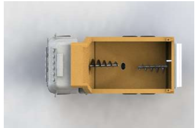
Fig -9: Top view of the modified pothole filling truck

These mixers can be operated using electric motors, and proper gearing system should be provided to increase its life. This arrangement has high initial cost, but after installation it can work as both: a mixer and a pothole filler truck. Patch mixture of emulsified asphalt and aggregate can be prepared on the same truck and only one driver is required to drive the truck and fill the potholes; hence, reducing the traffic on the road at the time of repair and cutting the labor cost.