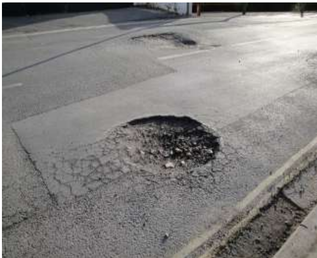
Fig -1 Pothole on an Indian road

In India, on an average, 7 people die everyday due to accidents related to potholes. Due to poor drainage system around roads, and use of poor quality materials for road constructions, introduction of potholes in Indian roads is very common. This structural failure is generated due to presence of water below the supporting structure of the road and then exacerbated by heavy traffic near the weakened zone, resulting in formation of a pothole. Figure 1 shows a dry pothole on an Indian road.