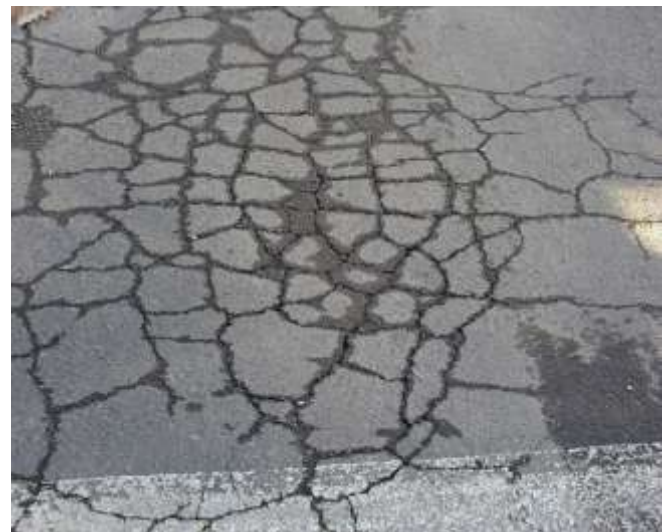
Fig -2: Crocodile cracks

Potholes are surrounded by cracks; these cracks are called crocodile cracks. This is the initial stage of asphalt pavement failure. Crocodile cracks are shown in Figure 2. These cracks, when subjected to heavy loads, tear apart and create a small hole. This hole becomes larger and larger with heavy traffic and stops growing until the whole water-weakened region is turned into a pothole.