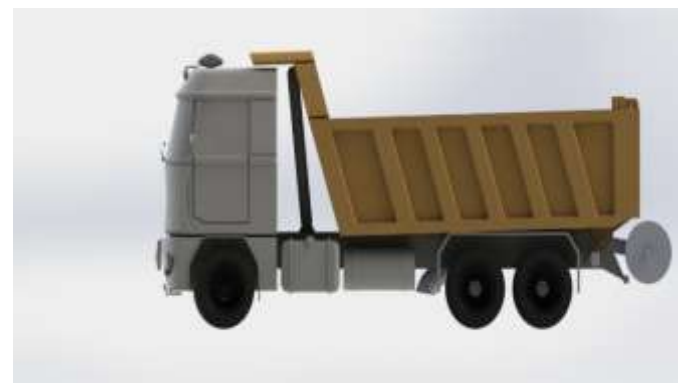
Fig -6: Modified pothole filling truck

On Indian roads, conventional pothole filler trucks can be made efficient by making few modifications in the trucks. Figure 6 shows a model of a modified pothole filling truck. Apart from a hole in its base and a roller at its rear, two mixer blades are added and can provide a good quality mixture of asphalt and aggregate.