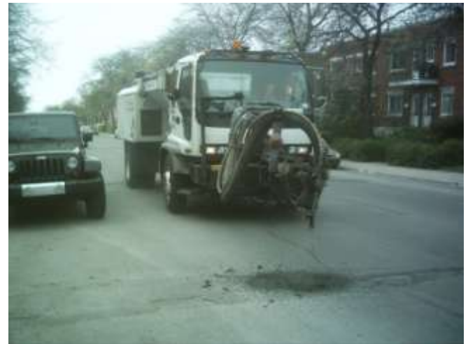
Fig -5: Spray-injection truck

Spray-injection repair is a semi-permanent repair. It uses a spray gun to fill potholes. It is one of the best methods to repair a pothole. Figure 5 shows a spray-injection truck.