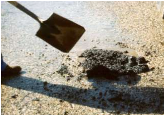
Fig -4: Throw-and-roll repair method

Throw-and-roll method is one of the oldest and simplest pothole repairing method. It is a temporary repair and done where the conditions are unfavorable: wintry or watery conditions. It can be performed on wet potholes but has a better repairing effect when done on dry potholes. It is used very commonly in India because of its speed and simplicity.