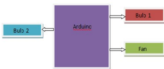
Fig 2. Device controlled

Fig. 2 shows hardware loop diagram. Arduino is the main control unit. All the applications will be controlled by Arduino. Various sensors like temperature, IR sensors are controlled by Arduino. In this system\LCD is used to display the entered password.