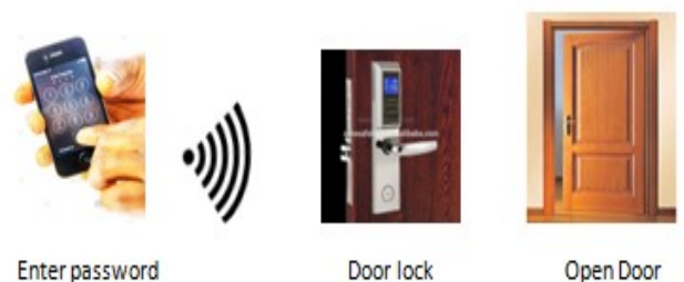
Fig 3. Door-lock System

Fig3. Describe the door lock system. In this, we enter the password using mobile phone which is display on LCD. And open the door if a password is correct and vice-versa.