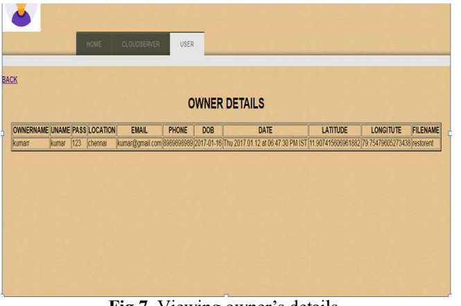
Fig.7. Viewing owner's details