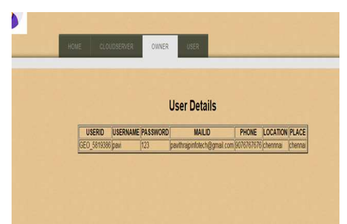
Fig.6. Viewing user's details