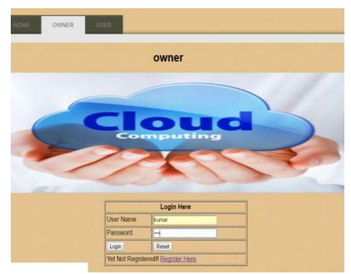
Fig.3. Owner's login