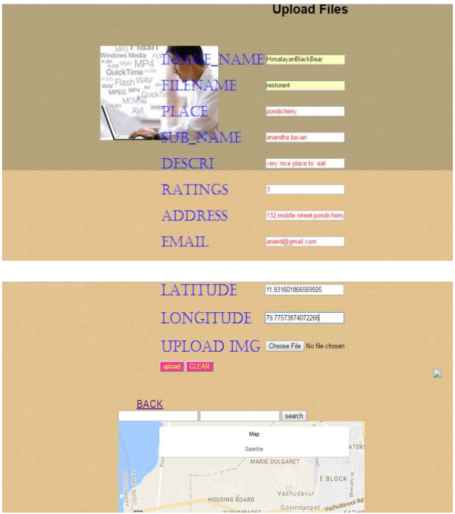
Fig.4. File uploading process