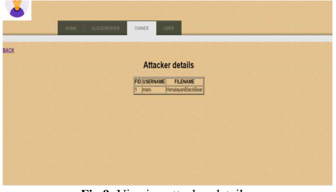
Fig.9. Viewing attacker details