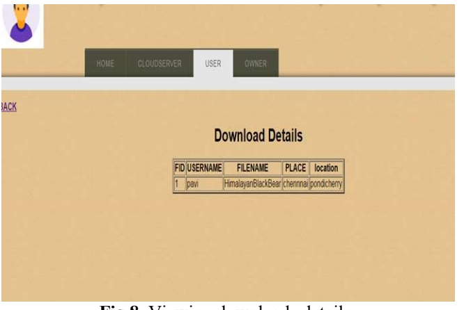
Fig.8. Viewing downloads details