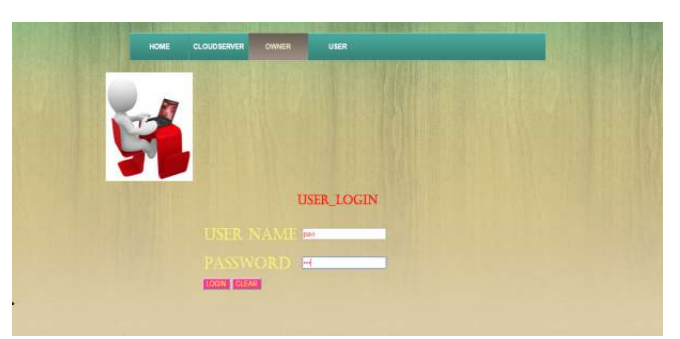
Fig.10. Owner's login