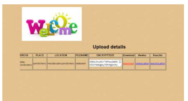
Fig.11. Viewing uploaded file details