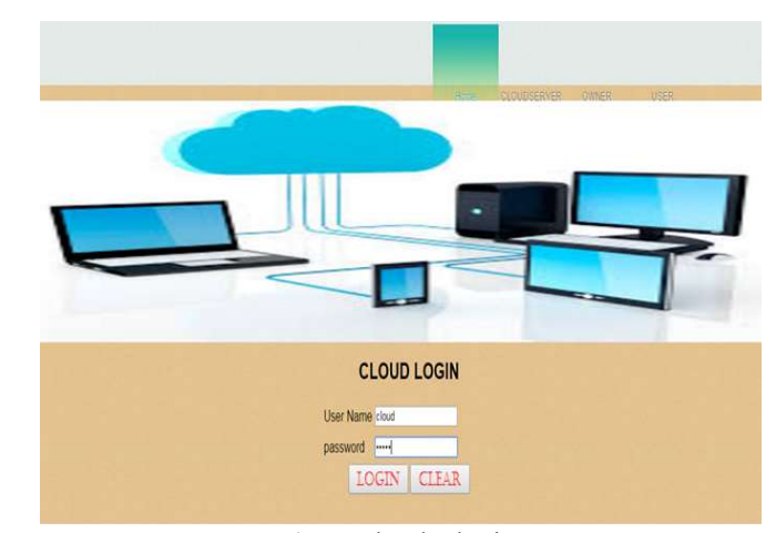
Fig.5. Cloud's login