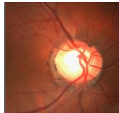
Figure 1. Image of glaucoma

Optic Nerve Head is the third approach which can promise the glaucoma presence in the eye. It can be done by expertise professionals.