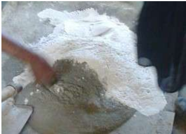
Fig 1.1 Ceramic Waste