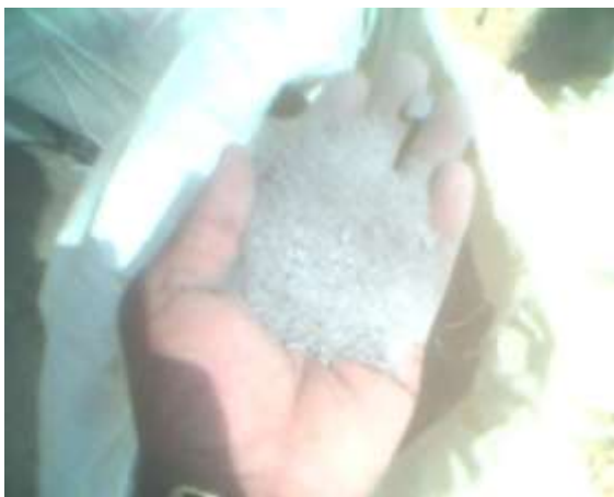
Fig 2 M-Sand

Msand : Manufactured sand is a substitute of river for construction purposes sand produced from hard granite stone by crushing. The crushed sand is of cubical shape with ground edges, washed and graded to as a construction material. The size of manufactured sand (M-Sand) is less than 4.75mm