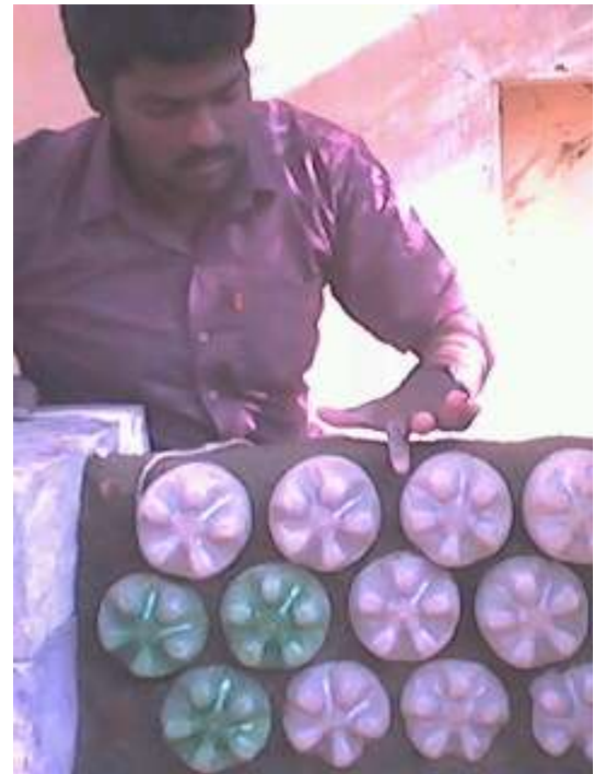
Fig 4 During construction