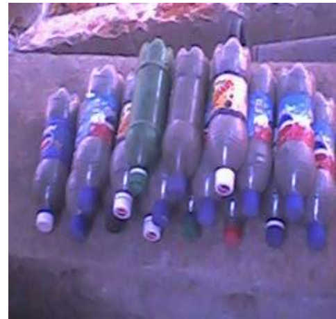
Fig 8 PET bottle with N-sand

Compressive load test: In the test, the compressive load for the pet bottle is found out by using compression testing machine or universal testing machine. Instead of: the Compressive strength of test because its contact area is difficult to find as single bottle area.