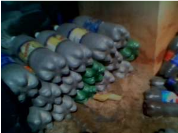
Fig 1 Petbottle

Pet bottle : PET a thermoplastic polymer resin of the polyester family and is used in synthetic fibers; beverage, food and other liquid container