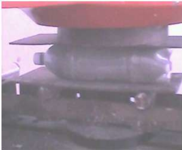
Fig 9 Compression Test

Water absorption test: if the water absorption capacity of a brick is more, its strength will be comparatively low.For first class bricks, the water absorption capacity should not be more than 20% by weight as per IS 3495- PART 2. This same procedure will follow for pet bottle brick work.