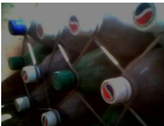
Fig 3 Nylon thread for tie