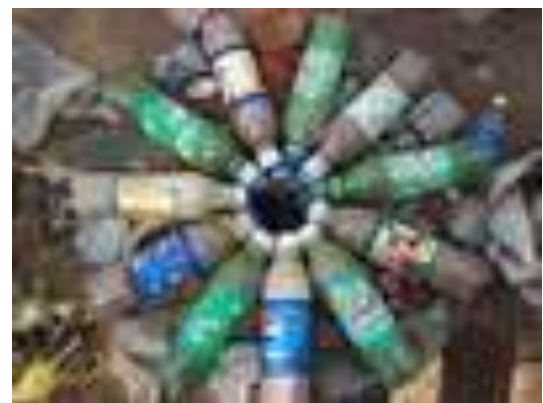
Fig 5 PET bottle brick1