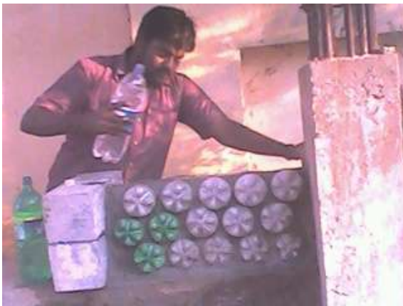
Fig 7 Curing Time