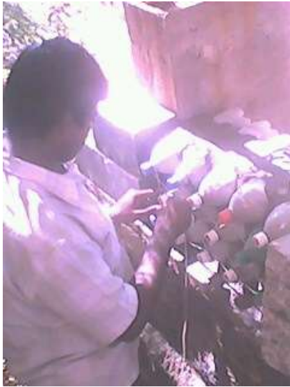
Fig 6 Construction