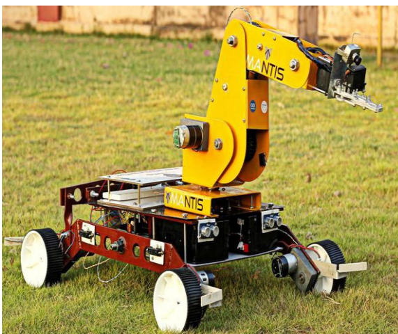
Fig1: Mobile robot with arm manipulator

And it wants the resolving the robot present condition and a target place and together within the identical coordinates.