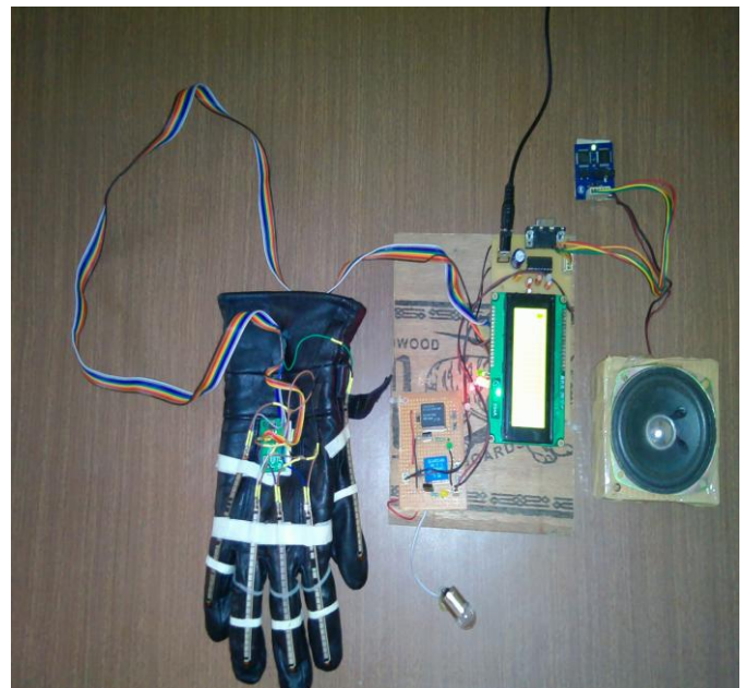
Fig.: 3. Experimental Setup

The whole system is powered by a 12V DC power supply. PIC18F877A microcontroller acts as the processing unit. An RS232 serial communication port is provided so that the coding process can be carried out anytime it is required. Flex sensors and the accelerometer are mounted on the hand-talk glove, the input is directly fed to the ADC of the PIC. A 16*4 LCD used to display the output. A text-to-speech module called EMIC2 converts the text into spoken words, which is fed to the speaker. To simulate home automation a DC bulb is connected using a relay, the bulb will turn on and off when the corresponding symbols are shown.