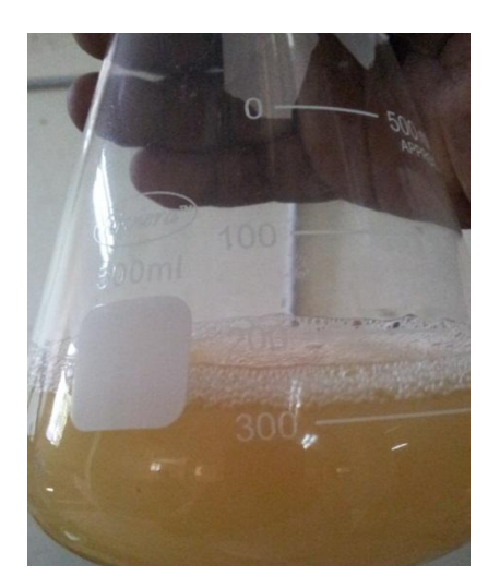
Fig -2: Solution with bacteria

Later the flasks are opened up and an exactly 1ml of the bacterium is added to the sterilized flask and is kept in a shaker at a speed of 150-200 rpm overnight. After 24 hours the bacterial solution was found to be whitish yellow turbid solution.