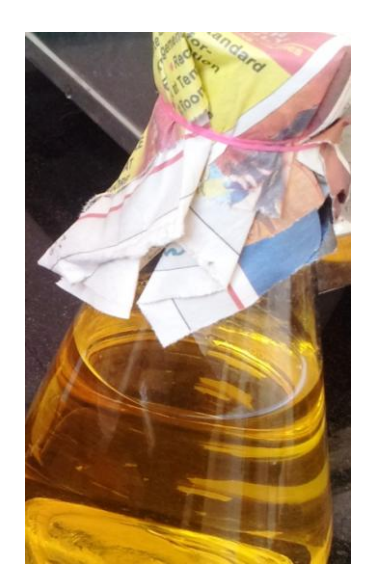
Fig -1: Solution without bacteria (only media)

Primarily 12.5g of Nutrient broth (media) is added to a 500ml conical flask containing distilled water. It is then covered with a thick cotton plug and is made air tight with paper and rubber band. It is then sterilized using a cooker for about 10-20 minutes. Now the solution is free from any contaminants and the solution is clear orange in colour before the addition of the bacteria [5].