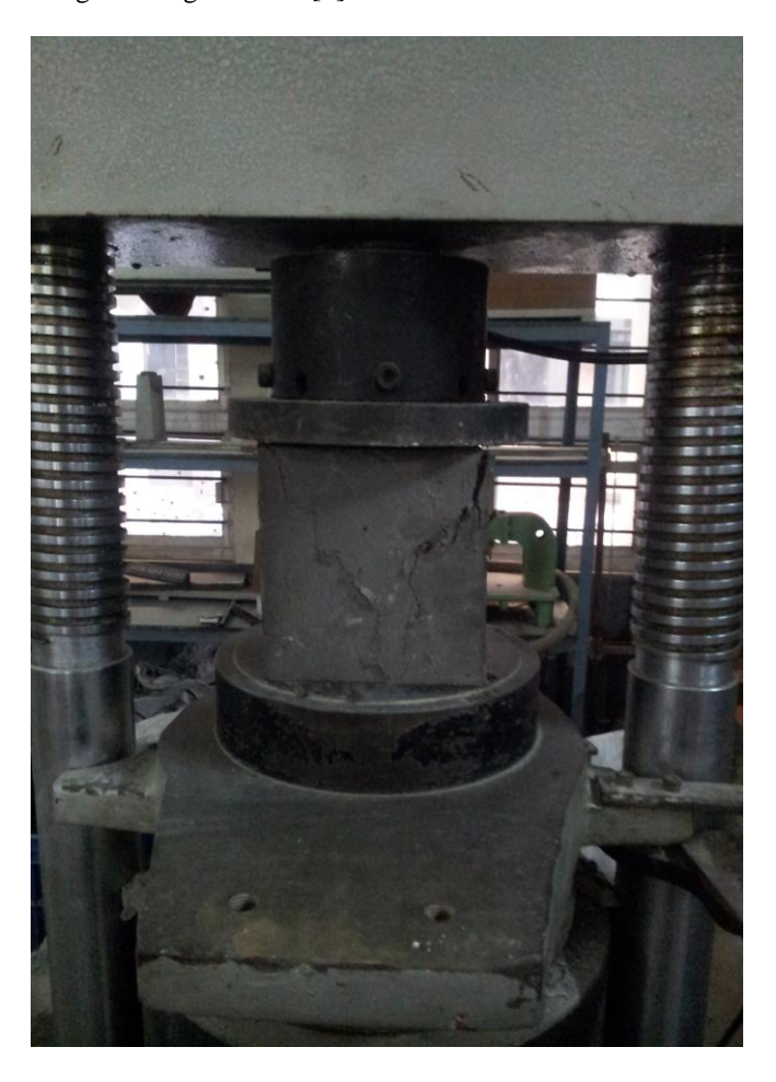
Fig -3: Concrete cube subjected to compression

The cubical Moulds of size 150mm x 150mm x 150mm were cleaned and checked against the joint movement. A coat of oil was applied on the inner surface of the Moulds and kept ready for the concreting operation. Meanwhile the required quantities if cement, fine aggregate and coarse aggregate (passing through IS sieve of 20 mm size and retained on 4.75 mm) for the particular mix are weighed accurately for concreting. Fine aggregate and cement were mixed thoroughly in a hand mixer such that the colour of the mixture is uniform. Then, weighed quantity of coarse aggregate is added to the mixer and then it rotated till uniform dry mixture is obtained. Then, calculated quantity of bacterial solution and water was added and mixing was continued for about 3 to 5 minutes to get a uniform mix. The wet concrete is now poured into the Moulds and for every 2 to 3 layers and compacted manually. After concreting operations, the upper surface is leveled and finished with a mason's trowel. The corresponding identification marks were labeled over the finished surface and they were tested for 7 and 28 day strengths in a compressive strength testing machine [4].