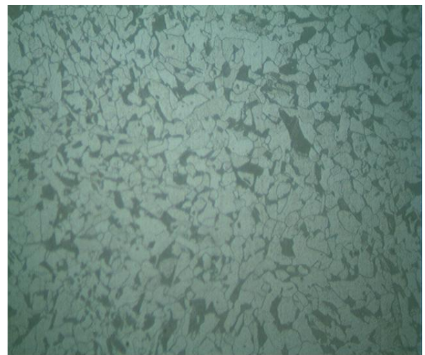
Fig -3: Microphotograph of sample A contain 100% zircon (400X)

To study of solidification characteristic micro-examination was carried out on Binocular metallurgical microscope (Almicro MM3) for the casted samples.