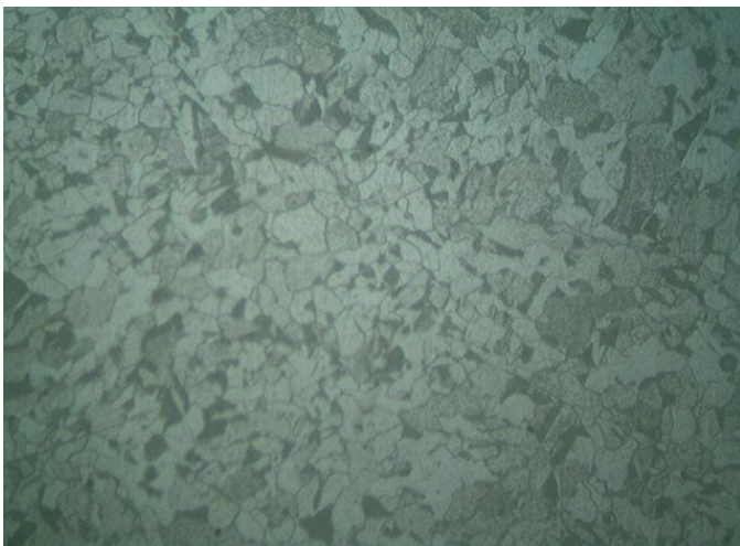
Fig -5: Microphotograph of sample C contain 70% zircon and 30% silica (400X)

The microphotograph of sample B shows the microstructure contains cementite and pearlite phases. Alumina mixed with zircon in the shell of mold for this experiment. Alumina has high thermal expansion compare to zircon, which cause distortion in phases, Microstructure of this experiments seems to be not uniform.