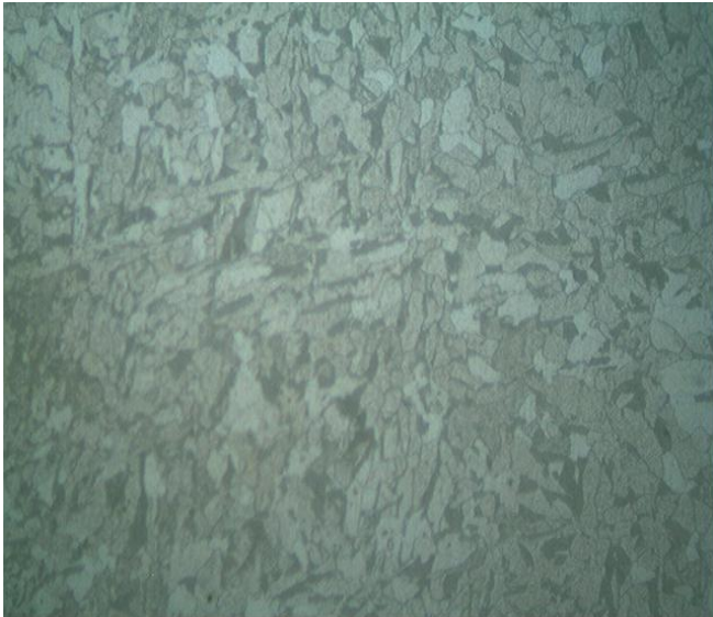
Fig -4: Microphotograph of sample B contain 50% zircon and 50% alumina (400X)

The microphotograph of sample A in Figure 3 reveals that the perfect microstructure contains uniform distribution of cementite and pearlite phases. Zircon was used as refractory slurry for shell mold. Zircon produce better microstructure due to its fine grain characteristic and it provide directional solidification. The directional solidification produces uniform grain size and no imperfection in microstructure of the low alloy steel.