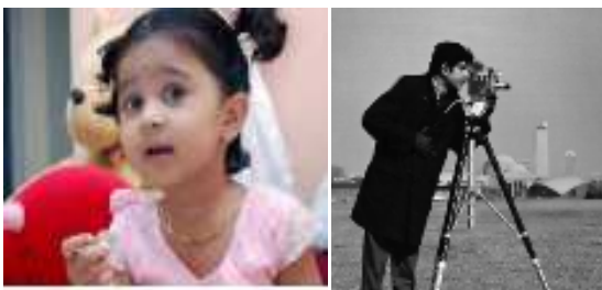
Fig 2: Standard Output Of Resolution Enhancement

In[3],adaptive BSR algorithm used in which the cost function is based on Alternating Minimization approach, the regularization for image and blur are Huber Markov Random field Model and Gaussian. The estimated PSNR value is 29 dB.